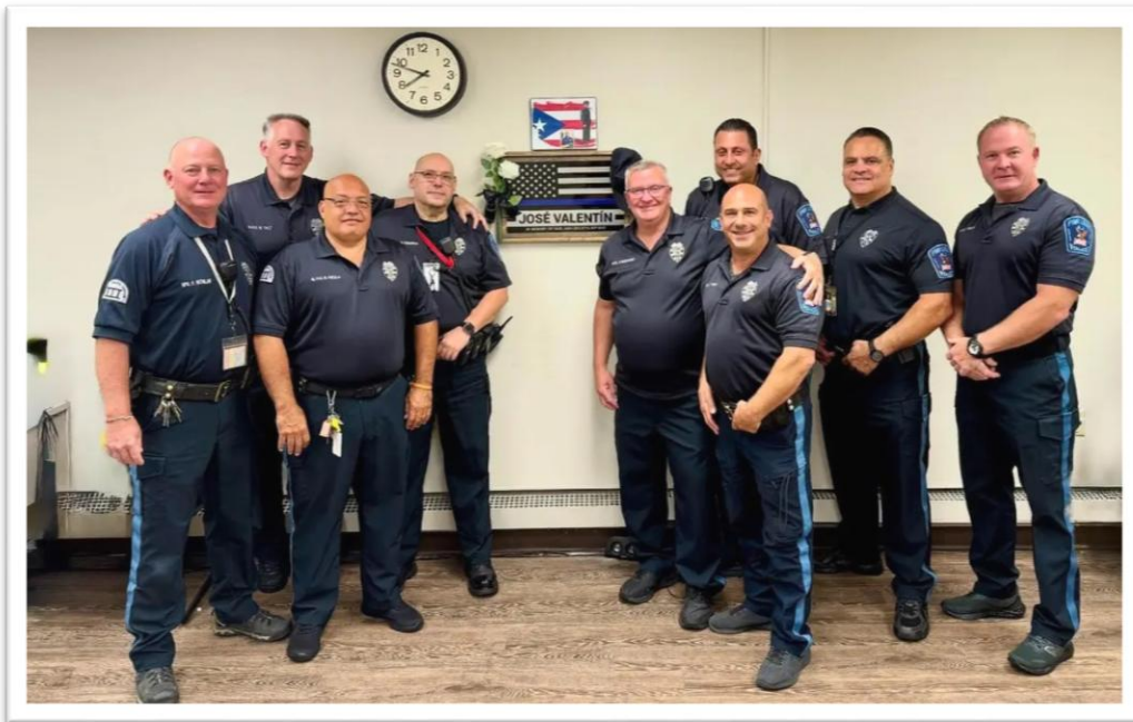
FLPD Class III Officers, First day of school, Sept. 2, 2025