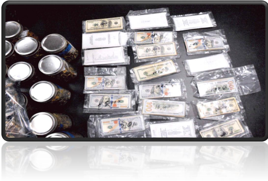
$152k in cash and narcotics seized