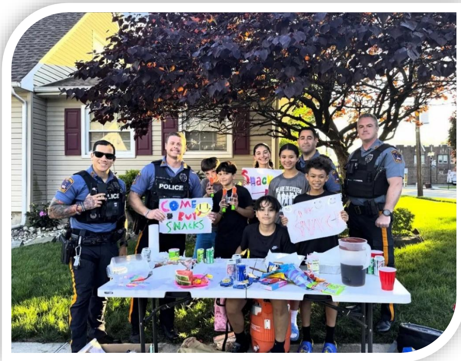
Patrol division community engagement in 2025