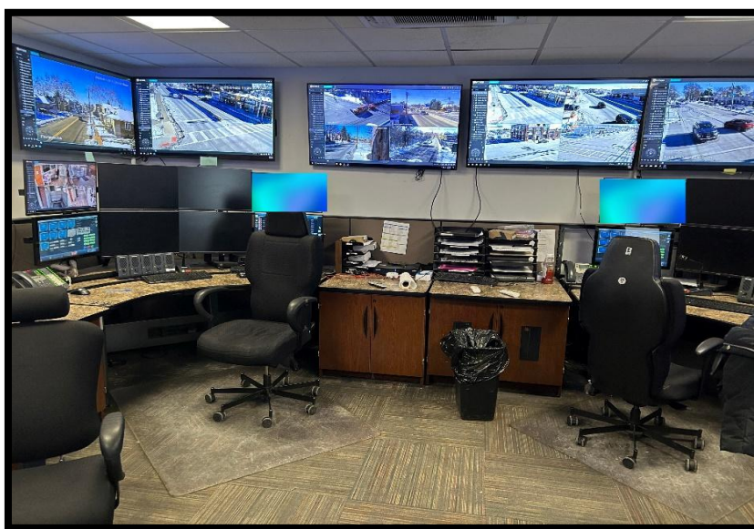
FLPD Communications Room & Police Desk

Communications handles in excess of 100,000 telephone calls and 9-1-1 calls per year. The volume of radio traffic is even higher. The communications room is staffed 24/7 by six rotating dedicated full-time personnel and supplemented by per diem staff and police officers on occasion. You can count on them to get the officers heading to your situation!